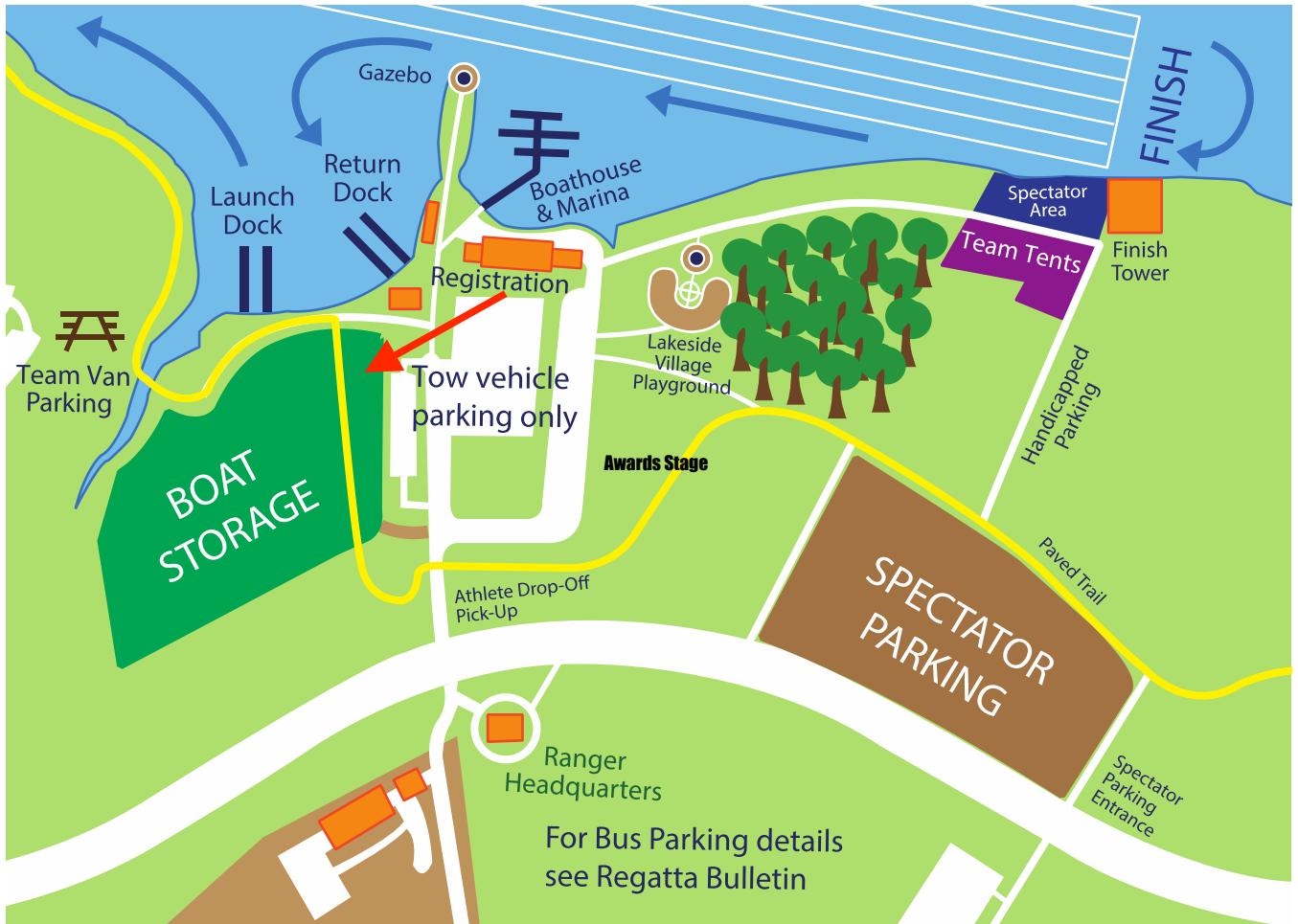
MERCER COUNTY PARK: CREW EVENT MAP